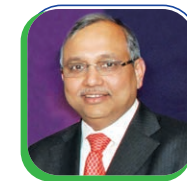
Mr Chandrajit Banerjee

Joint Secretary (Solar) Ministry of New & Renewable Energy Government of India