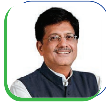
Mr Piyush Goyal

Hon'ble Minister of Power and New & Renewable Energy, Government of India