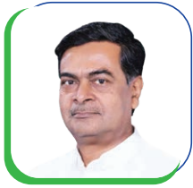
Mr RK Singh

Hon'ble Minister of Power and New & Renewable Energy, Government of India