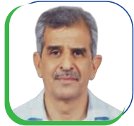
Mr Indu Shekhar Chaturvedi

Hon'ble Minister of State for New & Renewable Energy and Chemical & Fertilizers Government of India