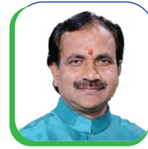
Mr Bhagwanth Khuba

Hon'ble Minister of Commerce & Industry and Consumer Affairs, Food & Public Distribution & Textiles Government of India