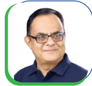
Prof Ajay Kumar Sood

The then Secretary, Minister of New & Renewable Energy (MNRE) Government of India